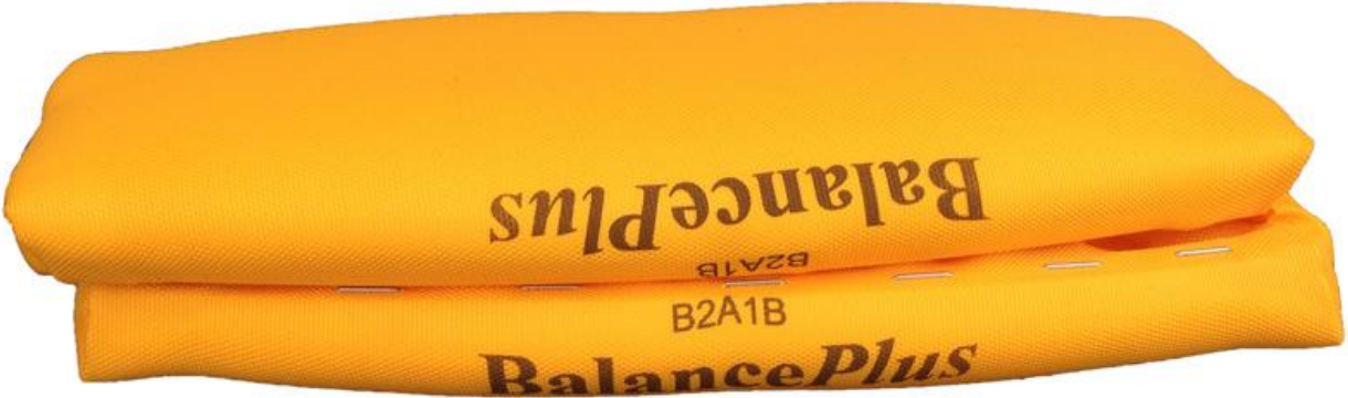
The Product Code is on the side of the pad stencilled on the fabric