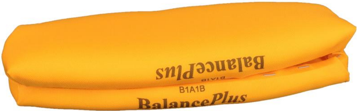
The Product Code is on the side of the pad stencilled on the fabric